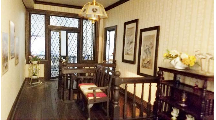
Above: Second Floor Landing