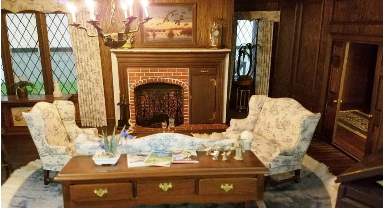
This page: Details of Great Room