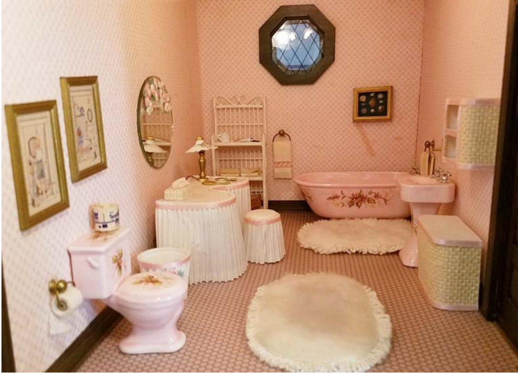
This page: Master Bathroom