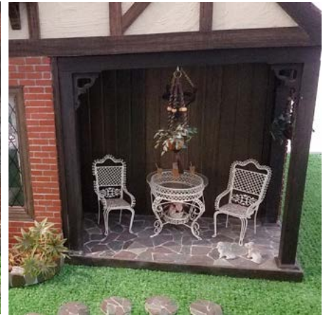
Below: Detail of Dining Room