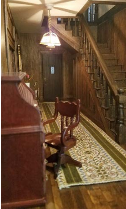
Above and below: Front Entry, Hallway and Staircase