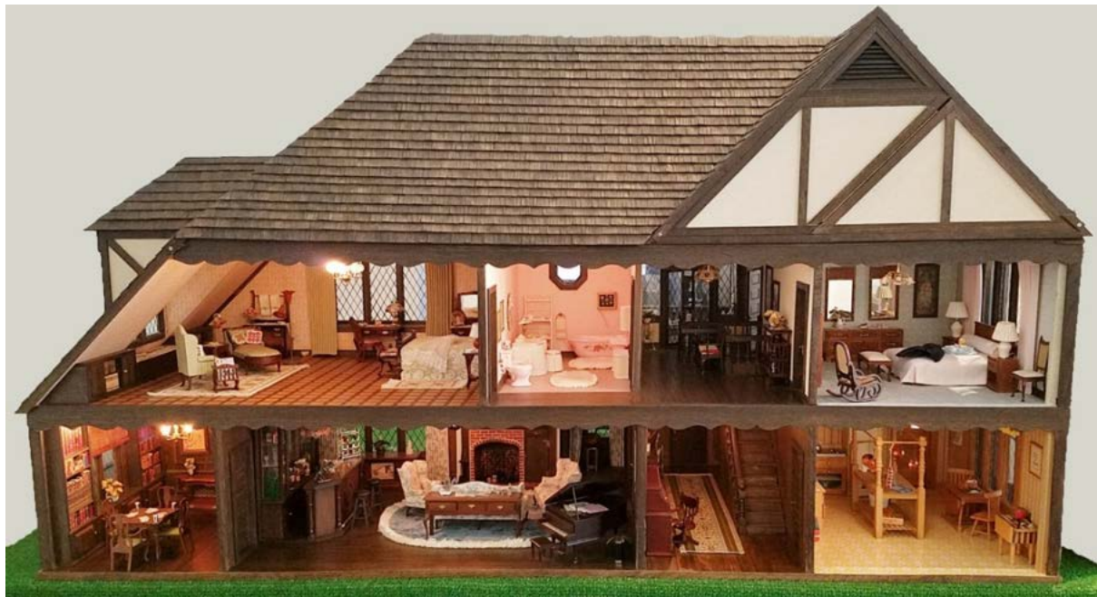
Above: Rear View of Alison's House. Right: Side View of Alison's House with exterior wall opened to show Dining Room and Children's Room/Nursery