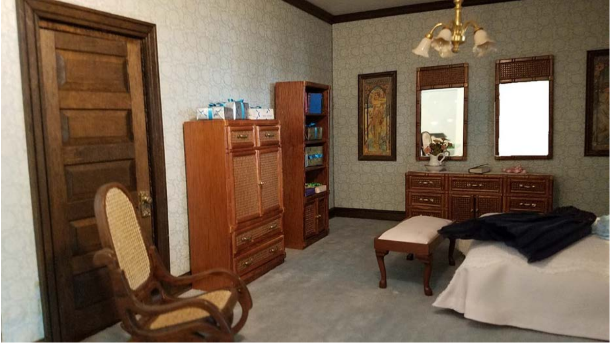
This page: Details of Second Bedroom