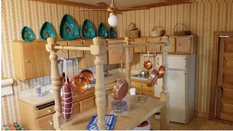
Above and right: Details of Kitchen