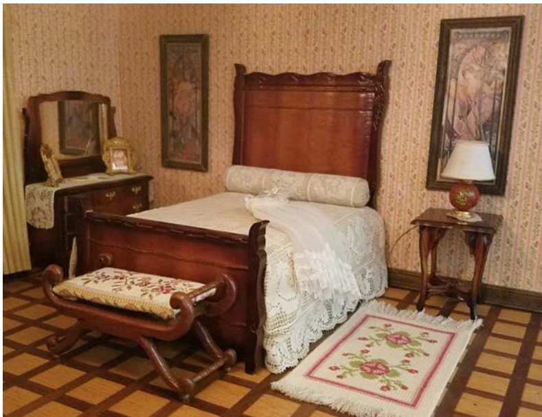
Above and below: Details of Master Bedroom