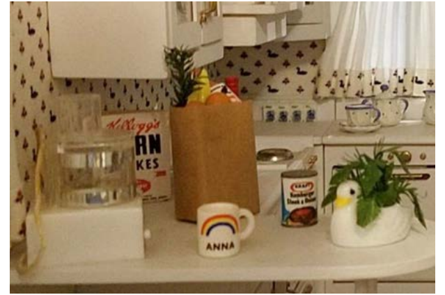
Above: Details of Kitchen. Below: Florida Room