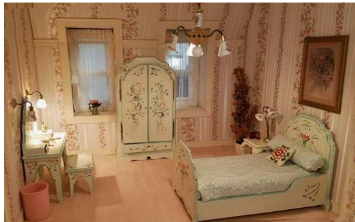
Above: Bedroom #1. Below: Bathroom #1

The second floor of Anna's house has two bedrooms, each with an adjoining bathroom, which are situated on either side of the upstairs landing. The off-white bed, armoire, dressing table and bench in one bedroom are decorated with a delicate painted floral pattern in keeping with the French manor style of the exterior architecture. The Friedmans created a warm feeling in this room with peach-toned carpeting and wallpaper. The wallpaper repeats the floral pattern painted on the furniture. Delicate lace serves as the bedspread and bolster cover, and one of Sarah Friedman's cross-stitched pillows completes the arrangement.