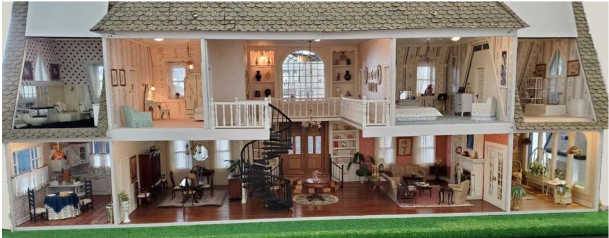
Rear view of Anna's House.