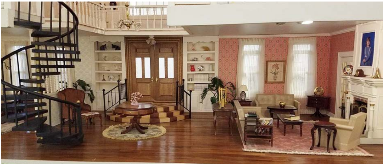
Above and below: Front Entry, Spiral Staircase, and Living Area