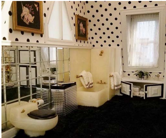
Detail of Bathroom #1