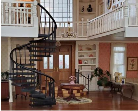
Another view of the Entry and Spiral Staircase