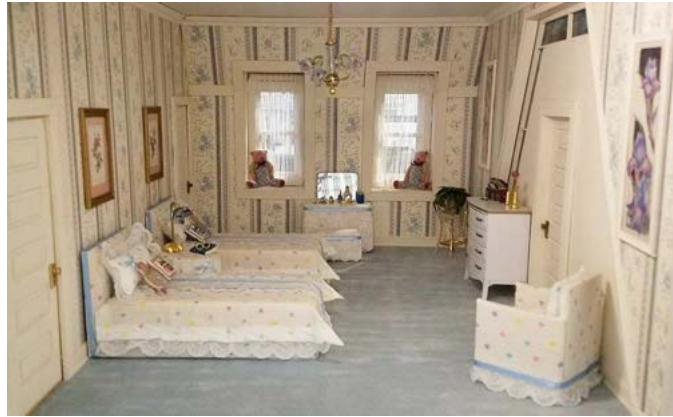
Above: Bedroom #2. Below: Bathroom #2

Friedman are arranged on the beds and a book and reading glasses have been left on the night stand. Translucent stained glass panels with blue and purple swirls inserted on either side and above the doorway between the bedroom and bathroom follow the angles of the roof pitch above. These panels and another one on the opposite (exterior) wall allow light into the bathroom while preserving privacy in this room. The bathroom fixtures are pink marble with gold fixtures and were made in England. The base of the sink is fashioned in a fish-and-seashell design.