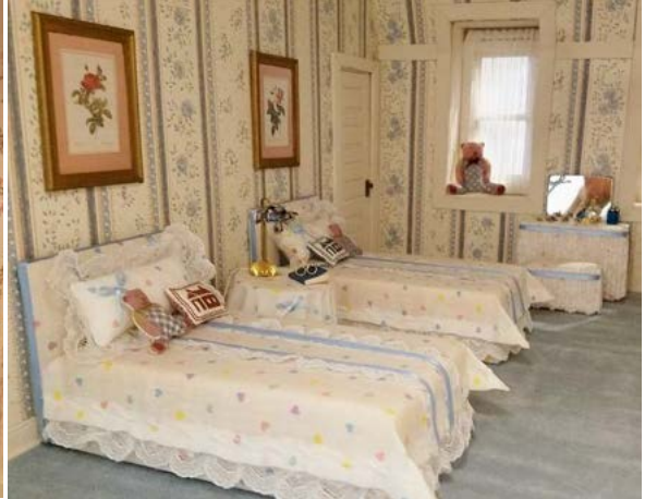
Another view of Bedroom #2