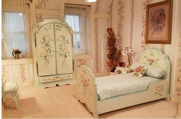
Another view of Bedroom #1