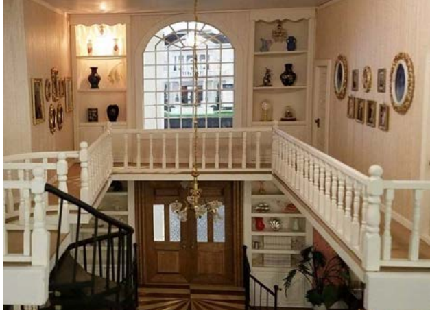
Above: Upstairs Landing. Below: Family photos on walls of Upstairs Landing