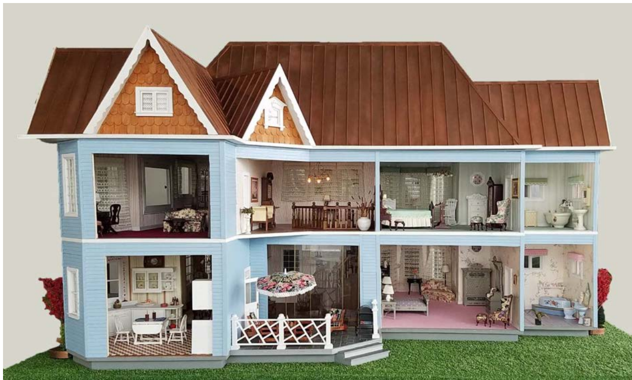
Rear View of Hannah's House