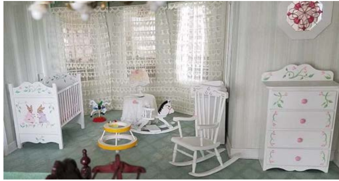
Above: Nursery. Below: Upstairs Bathroom.