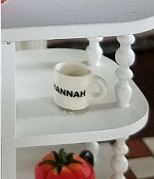
Kitchen Detail: Mug with Hannah's name imprinted on it