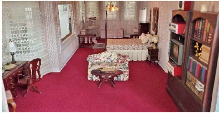
Master Bedroom and Bathroom.

The master bedroom has a dark mahogany four poster bed, chest of drawers, nightstand, and blanket chest set atop a rich maroon carpet. A framed photo of Hannah hangs over the bed.