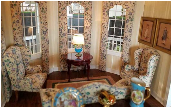
Above: Parlor. Right: Dining Room.

floral pattern. The drapes and valences surrounding the windows are made from the same fabric. A pink rug with teal and beige border is on the floor.