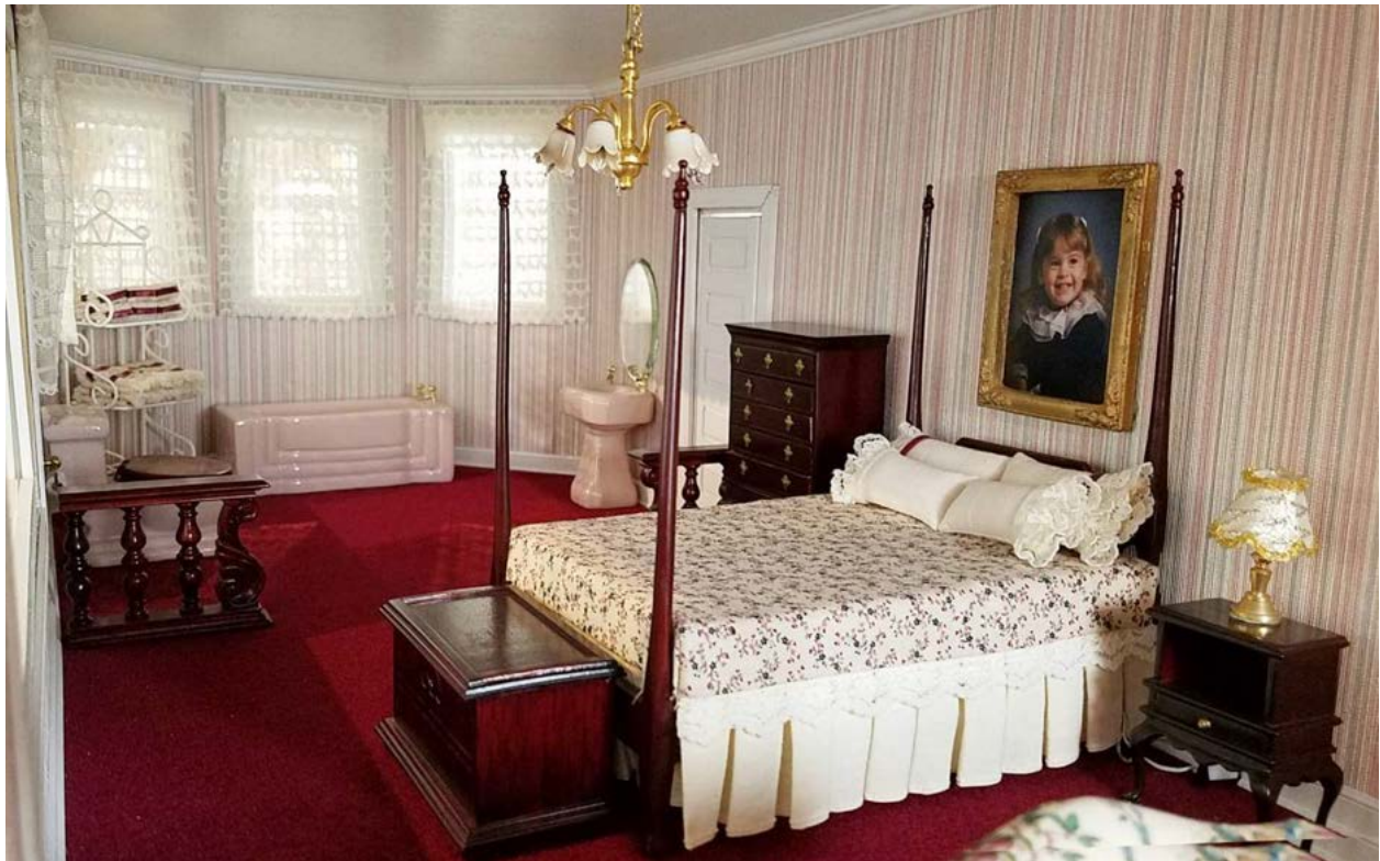
Detail of Master Bedroom