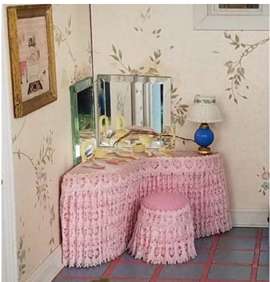
Above: Details of Downstairs Bathroom