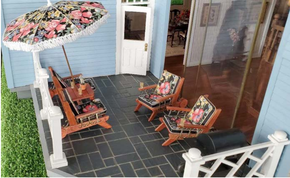
Above: Back Patio. Below: Exterior Details