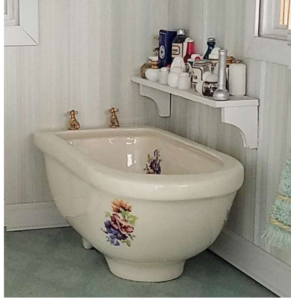
Detail of Upstairs Bathroom showing tub with hand painted floral design