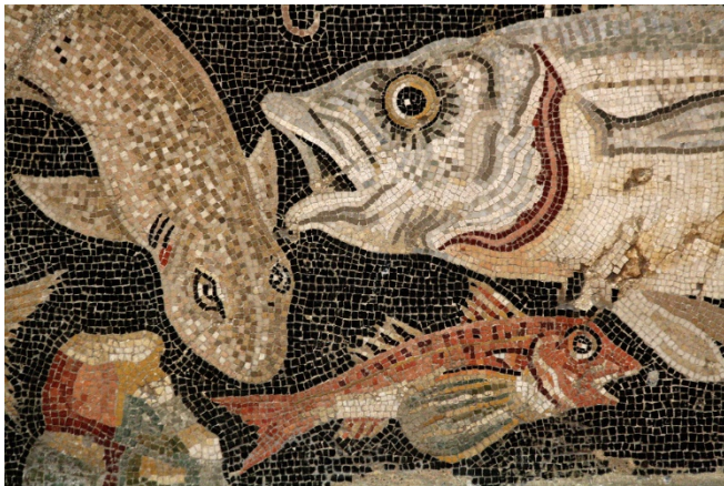
Detail of a mosaic from the House of the Faun, Pompeii

Roman mosaics made with small black, white and colored squares that typically measured a quarter inch to an inch in size. These squares, called tesserae , were cut from materials such as marble, tile, glass, pottery, stone and even shells. To make a mosaic, a base of fresh mortar was first prepared. The tesserae were then stuck into the mortar close together to make the picture. The gaps were then filled with mortar in a process known as grouting . Finally, the surface was cleaned and polished.