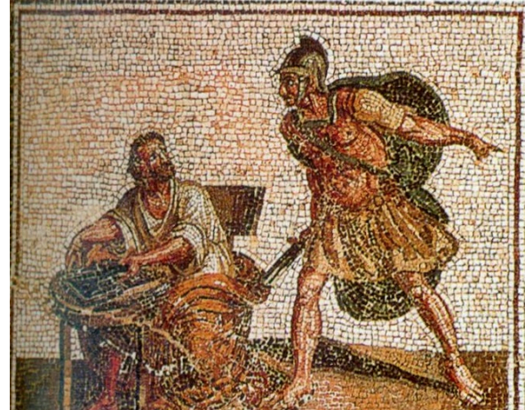
2 nd Century Roman Mosaic, Archimedes before his death with the Roman soldier

Mosaics are beautiful works of art that also tell us about everyday life and items that were used in Ancient Rome. We can look at them to see the clothes that people wore, the food that they ate, and the tools and weapons that they used. They also show us Roman activities like gladiator contests, sports, farming, and hunting. Some mosaics are realistic portraits of people.